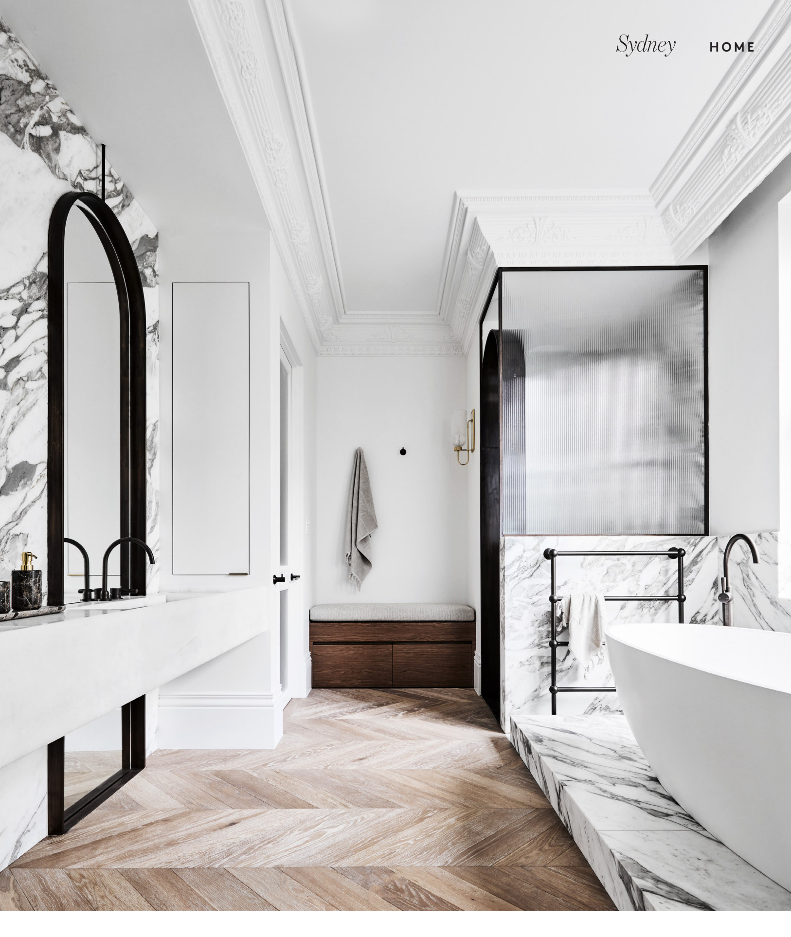
This page The master bathroom is a glamorous space with walls and plinth clad in Arabescato Oro marble and vanity in Café au Lait marble from Granite & Marble Works. 'Garrison' sconce from The Urban Electric Co. Fluted glass in a brass frame from Art of Metal. Victoria + Albert 'Barcelona' bath, Brodware 'Manhattan' tapware and Hydrotherm heated towel rail, all from Sydney Tap and Bathroomware. Custom bench seat in TrueGrain in Pinecone from Briggs Veneers with 'Creel' seat cushion from Janus et Cie. Opposite page, clockwise from top The dressing room has joinery doors in Alpi lkat from Elton Group with vanity topped in 'Emperador' marble from Granite & Marble Works. Custom mirror from Art of Metal. Flexform 'Bangkok' ottoman from Fanuli. Custom scalloped bedhead in 'Parissi' in Shell from Warwick Fabrics. Custom bedlinen in Busatti 'Burraco'. Cashmere throw from CASA by Kate Nixon. 'Hertz' bedside table from Brosa. 'Iyah' table lamp and wall art, both from Coco Republic. In the library, the custom marble bench has a cushion in 'Lovely' in Ochre from Warwick Fabrics. 'Lucia' side table and cashmere throw from CASA by Kate Nixon. Hudson Valley 'Colton' sconce from LightCo. 'Mykonos' chandelier on the balcony from Bloomingdales. 'Ardesia' tiles from Design Tiles.